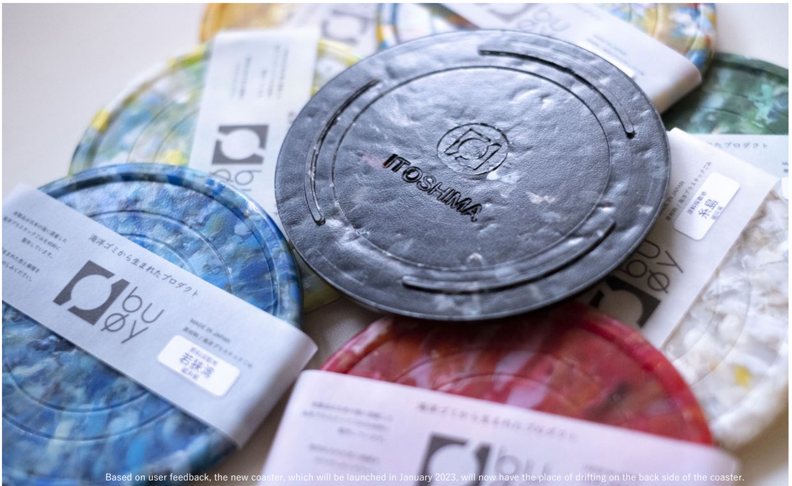
Based on user feedback, the new coaster, which will be launched in January 2023, will now have the place of drifting on the back side of the coaster.